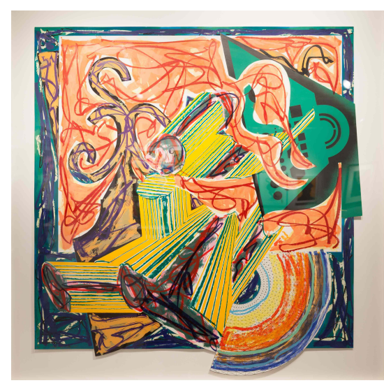
Frank Stella Illustrations after El Lissitzky's Had Gadya

Among the earliest works in the show is an 1883 watercolor, Castle of San Juan d'Ulloa, Vera Cruz , by Thomas Moran (1837-1926). Moran employs a near monotone palette to achieve a lush rendering of Mexico's architecture in its natural environment.