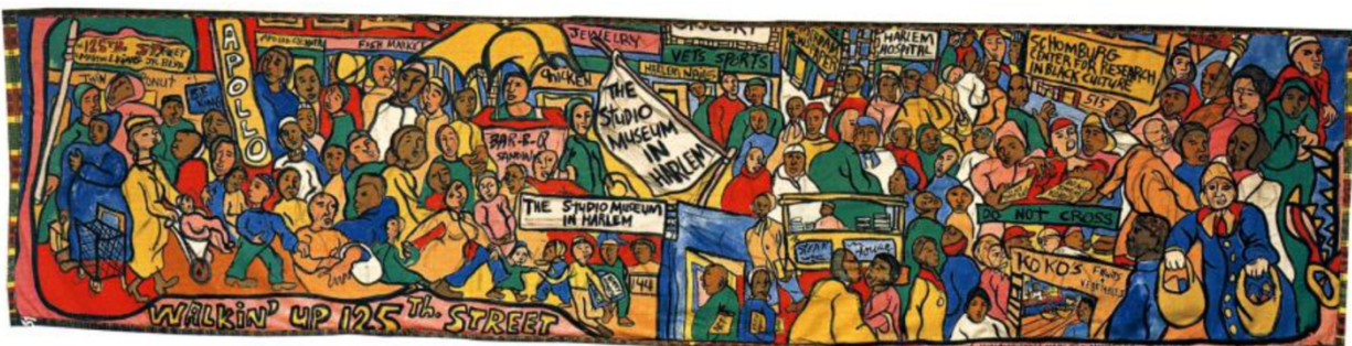
Walking Up 125th Street, 1989-1995, mixed media on fabric