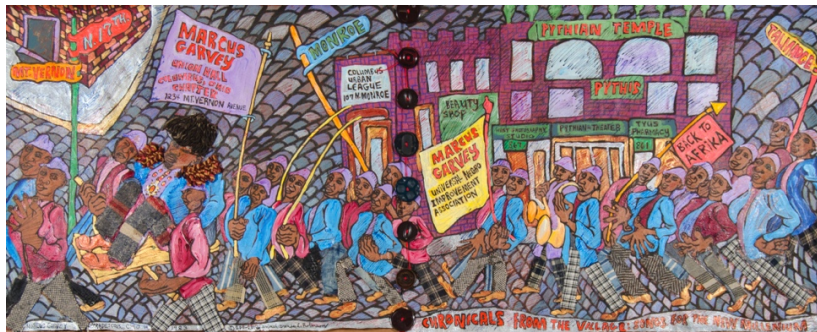
Chronicles of the Village Marcus Garvey Parade, 2010-12, mixed media on paper

ACA Galleries is pleased to announce a solo exhibition of work by Aminah Brenda Lynn Robinson on view from September 7 through October 29, 2022.