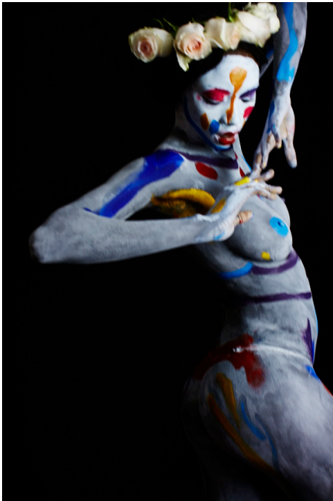
A. Verglas and B. Theodore, Georgie Dancing , 2015, edition of 10

New York, NY - ACA Galleries is pleased to announce its forthcoming exhibition, RAW BEAUTY: Bradley Theodore and Antoine Verglas , on view June 11 through July 31, 2015. The focus of the exhibition is a collaborative series between celebrated artist Bradley Theodore and renowned photographer Antoine Verglas that combines the excitement of street art with the sensuality of fashion photography. The canvasses for the project are internationally acclaimed models painted by Theodore and then captured on camera by Verglas. In addition to the collaboration series the exhibition at ACA Galleries will feature individual paintings by Theodore and photographs by Verglas.