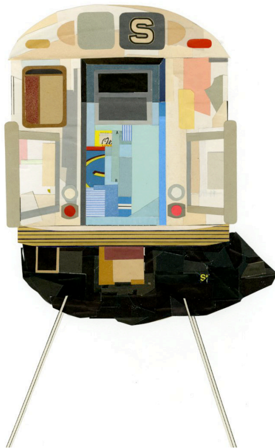
Greg Lamarche, Scrap Yard , 2020, hand cut paper collage, 18 x 14 inches

Hours: Tuesday – Saturday: 11am – 6pm. Sunday – Monday: By Appointment