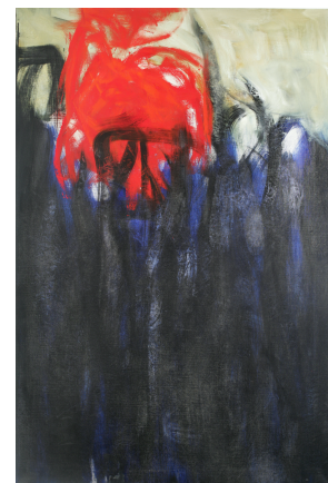
Untitled (Columns of Fire) , 1956, Oil on canvas, 48 x 32 inches

His work was included in the Whitney Annual in 1945 and the following year the Museum of Modern Art purchased a painting. He met Peggy Guggenheim, Mark Rothko and John Graham in 1947. His first solo museum show was at The Duncan Phillips Collection, Washington DC in 1950 and that year he also taught at Black Mountain College. From 1955 through 1977 he was an instructor at the Art Students League. Starting in 1970 he made yearly trips to the island of Lefkada in Greece.